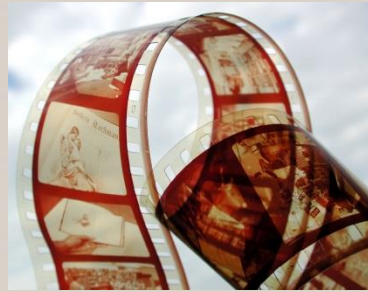
TEACHING WITH FILM AND VIDEO