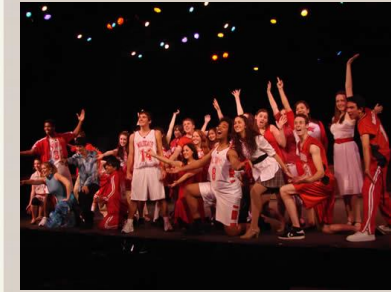
TEACHING WITH DRAMA AND MUSIC